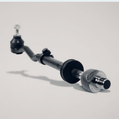
Lemförder tie rod – one of 10,000 spare parts stored at ZF Services Bremen.

ZF Services consistently continues the system expertise of ZF in the after sales market. With integrated solutions as well as the complete ZF product range, the division ensures the performance and efficiency of vehicles and their whole life cycle. Driveline and chassis technology from ZF are provided in retail shops under the product brands Sachs, Lemförder, Boge and ZF Parts.