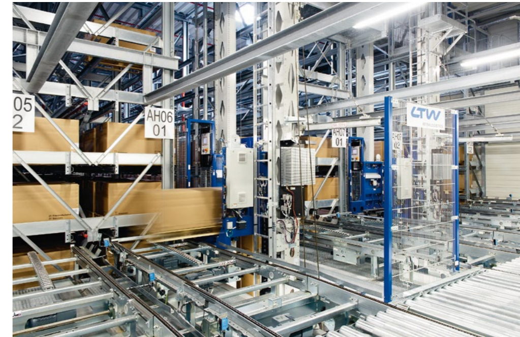
The eight aisle-bound LTW stacker cranes are equipped with service friendly details – such as a lifting assistance for changing heavy components or a video camera on the lifting device for quick and goal-oriented fault analysis.