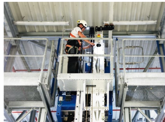
Even when designing the high-bay warehouse, safe and ergonomic work must be provided for service, e.g. with rugged maintenance cages on the rack.

ZF Services in Schweinfurt since the beginning of 2010, become interesting – and for which LTW stood the test for delivering six stacker cranes.