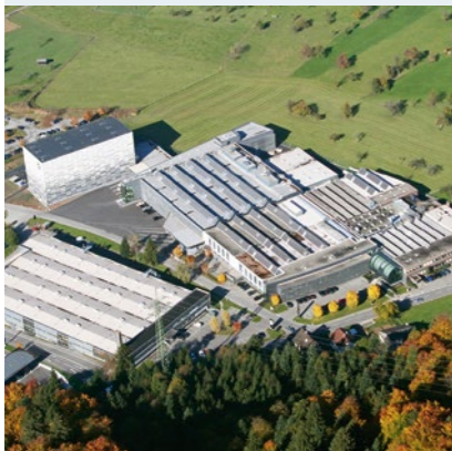
Net result of the current building project: 79% more building volume, 40% less fossil energy.

In 2009, the company was one of the first packaging producers in Europe who implemented the natureOffice standard for climate-neutral printing: the CO 2 emission values are calculated consistently for each print job. Naturally, the more environmentally friendly the production chain's organisation – all the way from cardboard production to logistics – the lower the compensation amount.