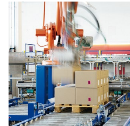
The existing robot was integrated into the new fully-automatic cardboard box conveying equipment with precise timing and minimum service interruption.