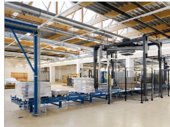
Conveyor line with automatic contour control, strapping, wrapping and labelling for pallets of different dimensions.

CTO and project manager Johannes Knapp sums it up: „From the beginning on, we have saved energy, including our personal energy, on a massive scale simply by the efficient material flow and interfaces.“